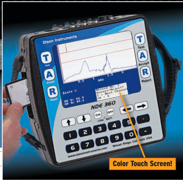
Color Touch Screen!